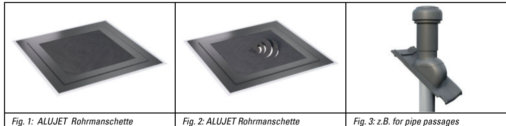
Fig. 1: ALUJET Rohrmanschette