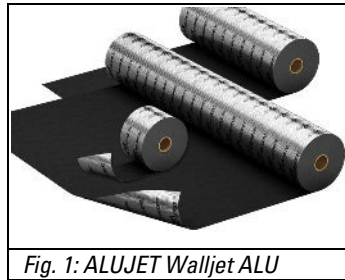
Fig. 1: ALUJET Walljet ALU

Product description ▶ ALUJET Walljet ALU consists of a composite layered aluminium structure and is used to create a horizontal seal in and underneath walls to protect against rising moisture as specified in DIN 18533-1 class W4-E.